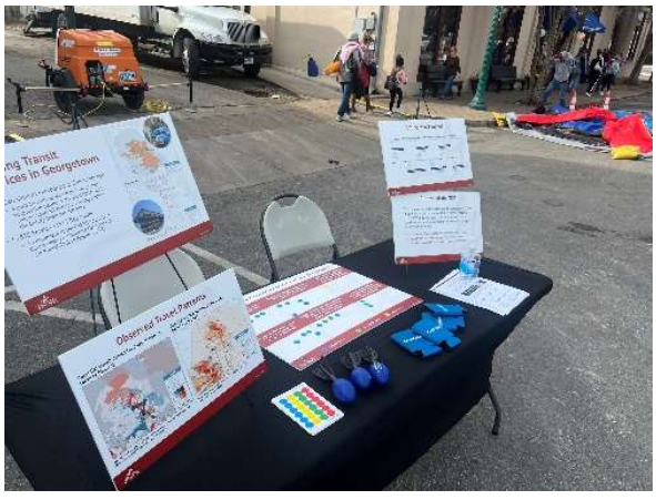
Figure 3: Christmas Stroll Pop-Up Event

The TDP team held two pop-up events at the Downtown Georgetown Christmas Stroll and one event at The Caring Place. The purpose of the pop-up events was to generate awareness about the TDP, virtual open house opportunity, public transit opportunities, and speak with residents about the City's transit needs. These pop-ups included tabletop boards that shared information on the TDP purpose and existing services, and a sticker board activity.