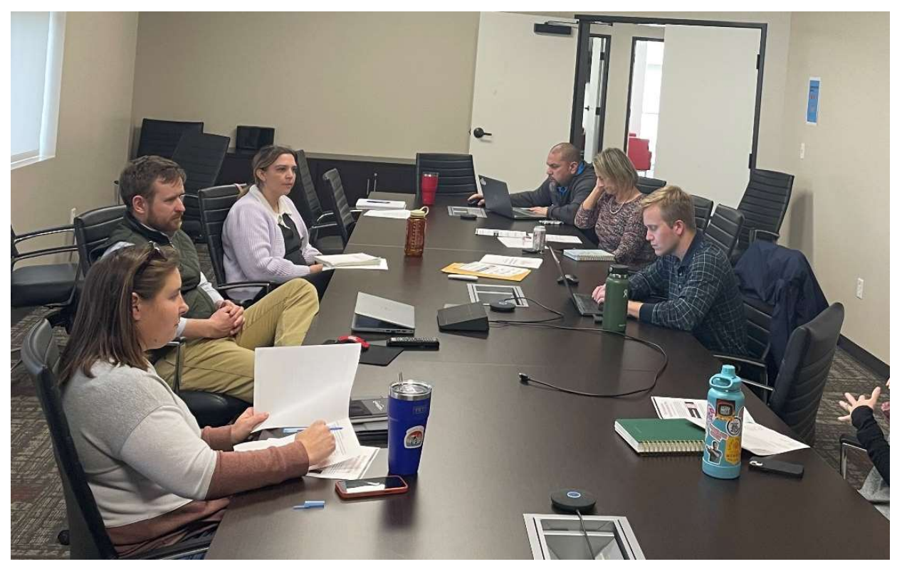
Figure 2: Youth Organization Stakeholder Group Interview

Stakeholder interviews were hosted both virtually and in person. An overview of the TDP purpose and schedule was provided to the interviewees, and the team facilitated open discussion on the City's mobility needs, opportunities, barriers, and any other relevant information. Through this effort, several key themes became apparent, including: